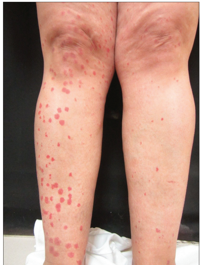
Figure 3: Erythematous-purpuric macules in both legs limited to the exposed area to diode laser. Fewer lesions in the left leg due to decrease in intensity

collected 36 patients with a similar clinical presentation, but of delayed onset, most of whom presented with lesions in the first session itself. 6 Biopsy in three cases was consistent with the diagnosis of urticaria. Landa points out that the etiology may be related to an antigen in the hair shaft or follicle itself, which is supported by the fact that, as the amount of antigen