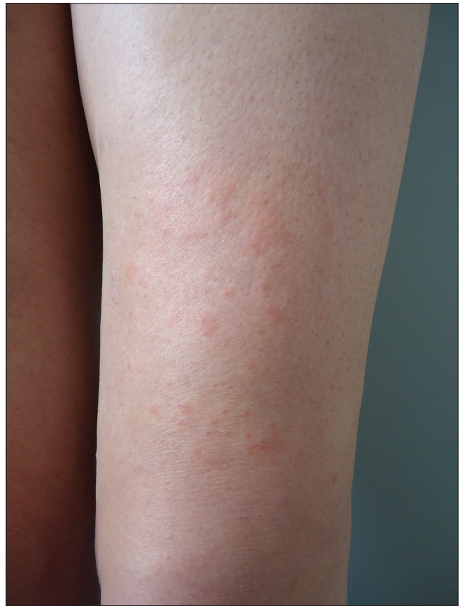
Figure 1: Erythematous papules that converge to form erythematous-edematous plaques limited to the exposed area to Alexandrite laser

Subsequently, the patient was exposed to alexandrite laser in a small area in the anterior thigh, and after one hour she developed erythematous, edematous plaques limited to the exposed area [Figure 1]. Given the background, a polymorphous light eruption induced by laser was suspected and a punch biopsy was obtained, revealing a perivascular infiltrate - predominantly lymphocytic and a bluish interstitial and perifollicular deposit that stained with colloidal iron, corresponding to mucin [Figure 2]. Immunofluorescence was negative. The diagnosis of alexandrite laser-induced localized primary cutaneous mucinosis was made and laser was not performed again. We hypothesize that the reason for the