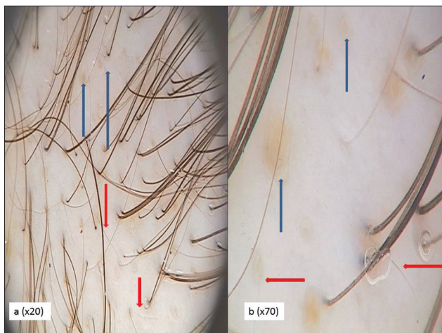
Figure 1: Androgenic alopecia. Trichoscopy of the frontal area of the scalp (a: 20-fold and b: 70-fold). Blue arrows – yellow dots, red arrows – vellus hairs