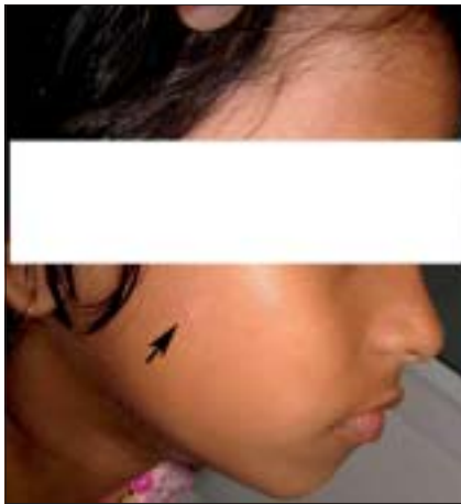
Figure 1: Pityriasis alba like lesions on face

alternative anti-epileptic treatment, following which the dryness and the skin lesions improved.