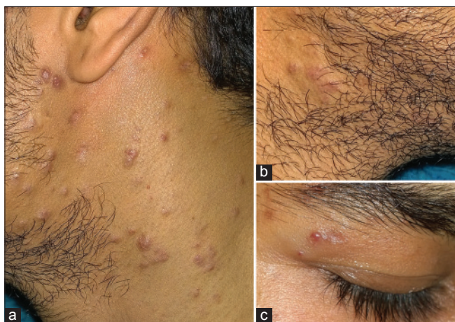
Figure 1: (a) Multiple erythematous papules on the left side of neck extending to the mandible (b) few similar papules grouped on the right submandibular region (c) two papules on the lateral aspect of right upper eyelid

A variety of cutaneous vascular tumors are described in the setting of POEMS syndrome: glomeruloid hemangiomas, microvenular hemangiomas, cherry angiomas and multinucleated cell angiohistiocytomas. However, only glomeruloid hemangiomas are considered specific, occurring in 26–44% cases. [1] In 2005, Vélez et al. reported the first case of solitary glomeruloid hemangioma without POEMS syndrome on the chin of an 86-year-old man. [5] Since then, only a handful of cases of glomeruloid hemangioma without this characteristic association have been described. On reviewing the literature, we could find only 11 other