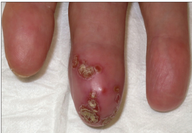
Figure 1: Erythema and swelling of the right middle finger with annular crusts in a confluent pattern

On physical examination, the distal part of her right middle finger was erythematous and swollen, with annular crusts in a confluent pattern [Figure 1]. Lesions were tender on palpation. Hair, nails and mucosae were spared. Rest of