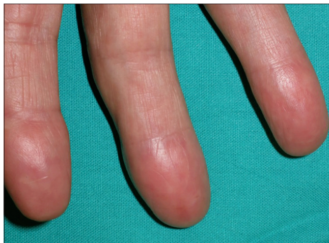
Figure 3: Complete clinical resolution after 6 months with triple antibiotic therapy

Successful treatment involves debridement, curettage of all infected tissue, excision of foreign bodies, as well as antimicrobial therapy for several months. 4 No controlled clinical trials of treatment for M. abscessus have been performed. If susceptibility testing shows sensitivity after prolonged incubation (14 days), this may predict a favorable outcome with a combination therapy of clarithromycin and amikacin, possibly supplemented with cefoxitin or a fluorquinolone. 5