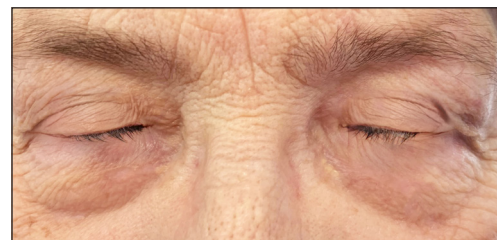
Figure 1b: Clearance of bilateral grade III xanthelasma palpebrarum, two months after the copper vapour laser treatment

How to cite this article: Ponomarev IV, Topchiy SB, Shakina LD. Successful treatment of xanthelasma palpebrarum grade III with copper vapour laser radiation (578 nm). Indian J Dermatol Venereol Leprol doi: 10.25259/IJDVL_339_2023