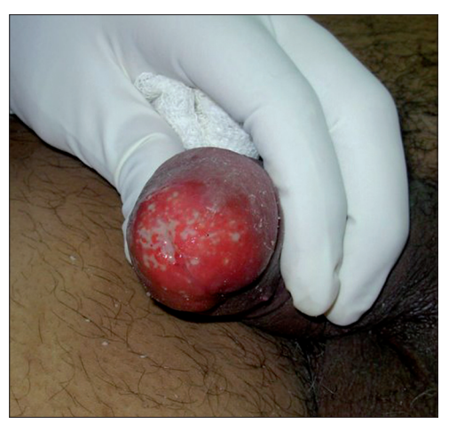
Figure 1: Bacillus Calmette Guerin induced balanitis: Multiple ulcers of size 2–3 mm in the peri-meatal location

varying from 3 to 5 cm, matted and nontender. There was no fluctuation. No other lymph nodes in the body were enlarged. There was no history of premarital or extramarital sexual exposure. There was no history of genital ulceration in the past. He had low grade fever and malaise at the time of presentation but there was no history of weight loss or chronic cough. Chest X-ray was within normal limits, and Mantoux was 8 mm at 48 hours. Tzanck smear for multinucleated giant cells as well as Venereal Disease Research Laboratory (VDRL) and HIV antibody tests were negative. Culture for herpes simplex virus was not done.