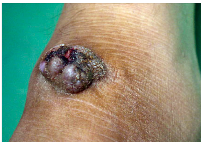
Figure 1: Verrucous nodule over ankle joint