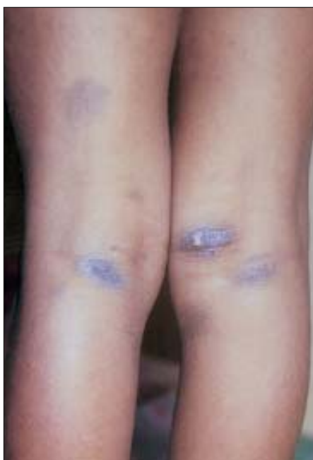
Figure 1: Lesions of urticaria pigmentosa mimicking lichen planus (Case 2)

Cutaneous mastocytosis may mimic other dermatological conditions. Childhood disease may be