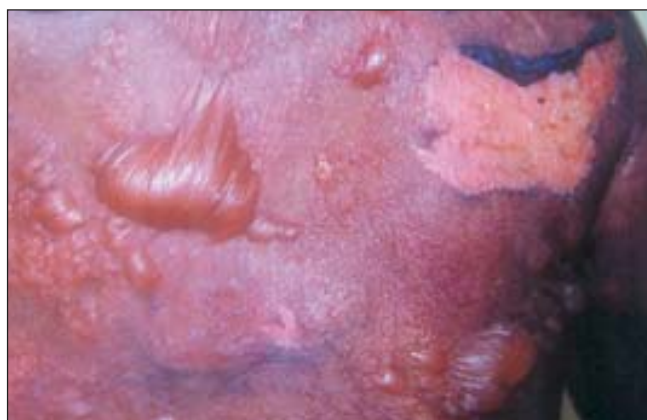
Figure 2: Bullous mastocytosis with areas of denudation, mistaken as staphylococcal scalded skin syndrome (Case 3)