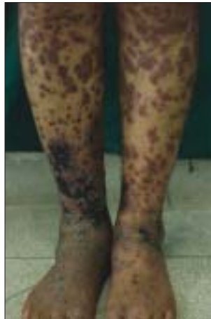
Figure 2: Atypical target lesions seen in background of urticaria in a patient of urticarial vasculitis