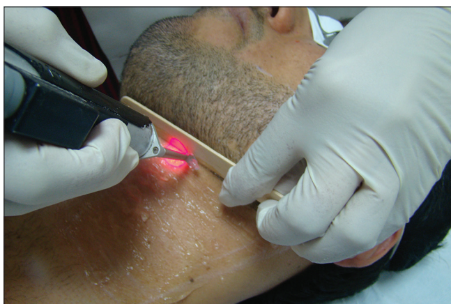
Figure 1: Correct alignment of the laser beam with the tongue depressor is necessary for optimal shaping

Here, we present an easy, inexpensive way to allow precise shaping along the beard margins with the aid of wooden, disposable tongue depressors. The patient is instructed to come after shaving as per the desired beard shape. The tongue depressor is kept just adjacent to the beard line either flat or at an angle to protect the hair inside the margin [Figure 1].