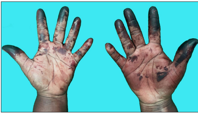
Figure 1: Brownish discoloration of the bilateral palms.

diagnosed with cashewnut dermatitis. In the cashewnut, the space between the inner kernel and the double-layered outer shell contains a highly caustic brown, oily liquid rich in anacardic acid and cardol. Workers who handle cashewnut shells are exposed to the shell oil during the slicing process, which causes cauterisation, clinically presenting as brownish to black, thick layers of dead skin on the palmar and dorsal surfaces of their hands.