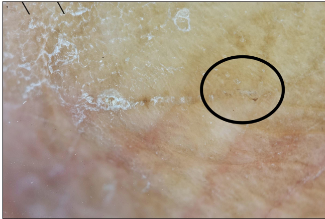
Figure 1: Dermoscopy (Dermlite DL5, polarised 10x) showing the delta sign of scabies (black circle).

The classical dermoscopic feature seen in scabies is the delta sign (representing the mouth part of the mite) and the 'jet with contrail' pattern (representing the mite with the burrow)