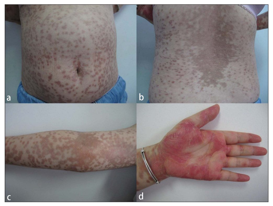
Figure 1: (a, b) Lichenoid chronic cutaneous GVHD with multiple hyperpigmented scaly patches on the trunk, (c) Multiple hyperpigmented scaly patches on the upper limb, (d) Erythematous scaly plaques on palm.