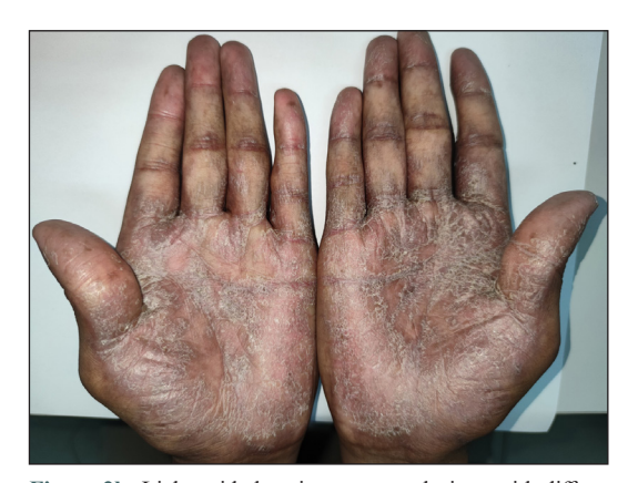
Figure 2b: Lichenoid chronic cutaneous lesions with diffuse hyperpigmented plaques and desquamation on both palms.