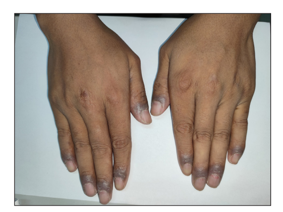
Figure 2a: Lichenoid chronic cutaneous lesions with dark brown patches around the nails of both hands.