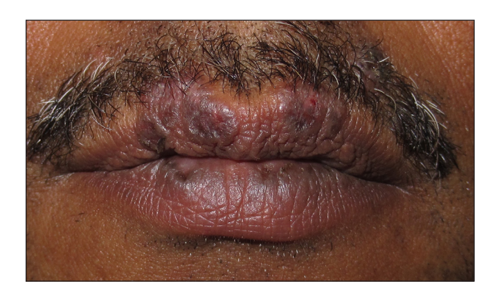
Figure 1: Multiple erythematous to reddish-grey flat-topped small papules with erosions and crusting.

Lichenoid contact cheilitis can be mistaken for lichen planus, especially in skin of colour, as both present as violaceous or reddish-lilac papules and plaques. Table 1 summarises the differences between lichen planus and LCD. A history of contact with a positive patch test for the concerned