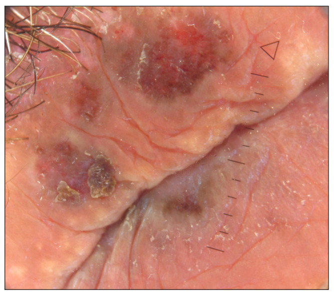
Figure 2a: Dermoscopy shows scale-crust, erosions, and reddish-grey structureless areas (non polarised, 10x).

Garg, et al. Lichenoid contact cheilitis