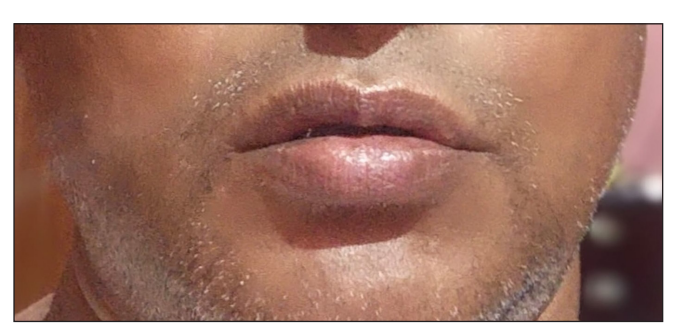
Figure 3: Complete subsidence of lesions post therapy.