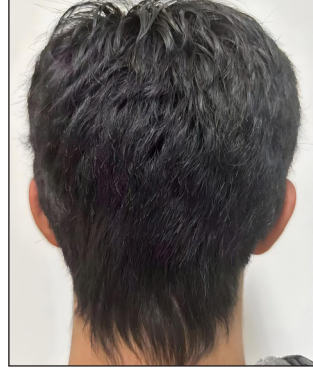
Figure 2i: Case 5 before treatment.