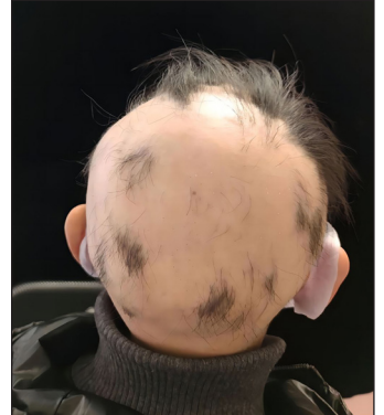
Figure 2a: Case 1 before treatment.