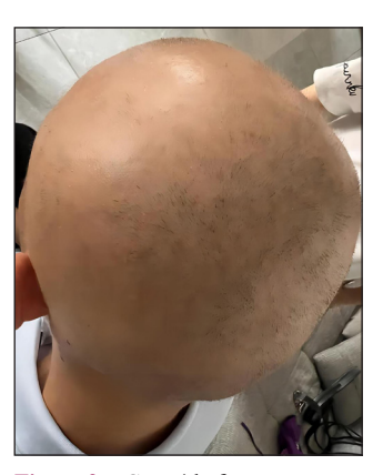
Figure 2g: Case 4 before treatment.

Figure 2f: After treatment of tofacitinib for 8 months, Case 3 showed significant hair recovery and the SALT score decreased from 100 to 10.