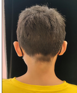
Figure 2b: After treatment of tofacitinib for 6 months, Case 1 showed rapid hair recovery and the SALT score decreased from 85 to 4.