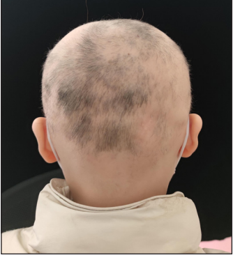
Figure 2c: Case 2 before treatment.