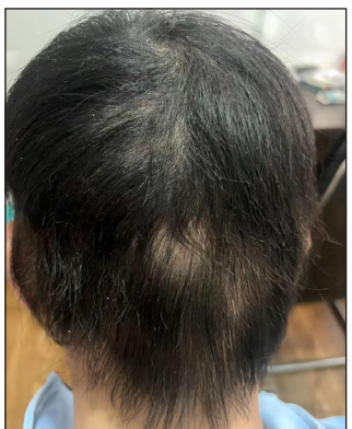
Figure 2h: Case 4 after 8 months of tofacitinib treatment showed an improvement in the SALT score from 100 to 9.