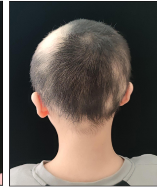
Figure 2d: Case 2, an 11-year-old girl, achieved obvious hair regrowth after 6 months of tofacitinib treatment, with an improvement in the SALT score from 88 to 55.