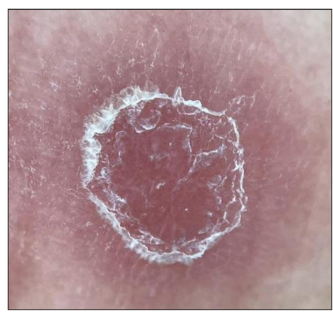
Figure 2: Collarette of scales visible to the naked eye was confirmed on dermoscopy which showed scales arranged in linear configuration which was suggestive of Biett's collarette. (Polarised, contact, x10).