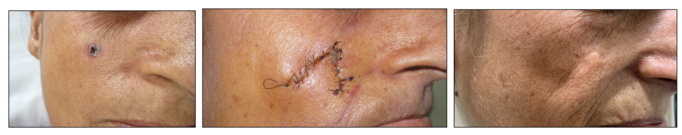
Figure 2a: A clinical case illustrating the Figure 2b: Post-operative image taken at 7 days after the Figure 2c: A photograph captured 8 weeks postmanagement of basal cell carcinoma on the surgical procedure. cheek using surgical excision followed by advancement flap.