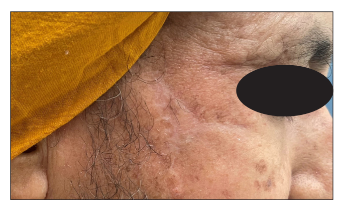
Figure 3b: Post-treatment photographs after Mohs micrographic surgery and rotational flap.