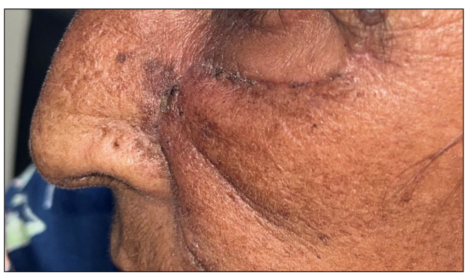
Figure 1b: Post-operative clinical photographs after standard surgical excision and advancement flap.