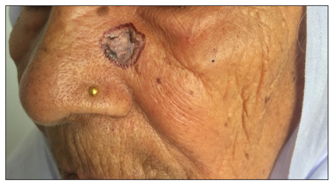
Figure 4a: Clinical presentation of basal cell carcinoma on the medial cheek of an elderly woman.