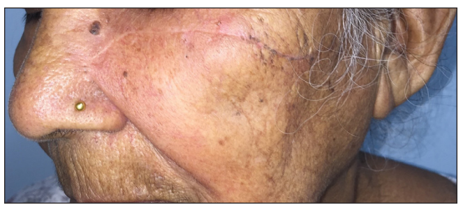
Figure 4d: Follow-up images obtained after 8 weeks, demonstrating a wellhealed, thin, linear scar.