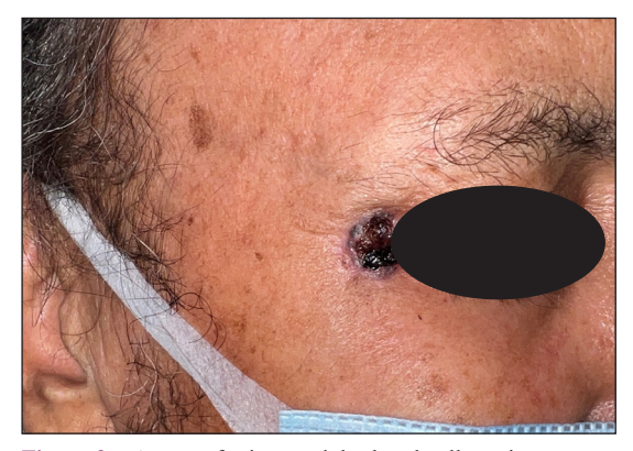
Figure 3a: A case of micro-nodular basal cell carcinoma over the lateral margin of the eye showing an ulcerative surface and beaded margin.

7.1% developed new BCCs at different sites, which included two who also had xeroderma pigmentosum. Three patients died, one from lung cancer, another from erythroderma secondary to pityriasis rubra pilaris, and the third from multiorgan failure.