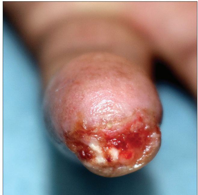
Figure 1b: Round-to-oval ulcer with erythematous fleshy eroded granulation tissue present on the hyponychium extending to the fingertip (ventral view)