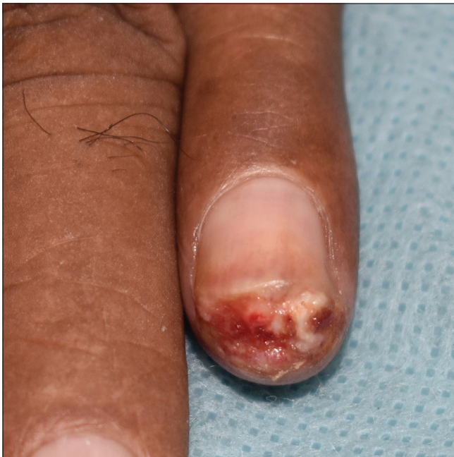
Figure 1a: Round-to-oval ulcer with erythematous fleshy eroded granulation tissue present on the hyponychium extending to the fingertip (dorsal view)