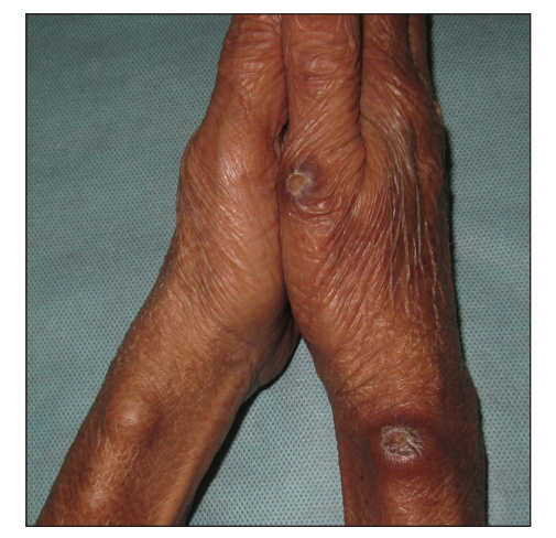
Figure 1: Well-circumscribed nodular swellings on the distal radial border over the bilateral wrist area and over the right proximal thumb.

and a glove-and-stocking pattern hypo-aesthesia were noted. The differential diagnoses of ganglion cyst, giant cell tumour of the tendon sheath (GCTTS), and epidermoid cyst were considered, and a fine needle aspiration cytology (FNAC) was done. FNAC revealed foamy macrophages containing clumps of acid-fast-bacilli (AFB) on Ziehl Neelsen (ZN) staining [Figure 2]. High-resolution ultrasonography (HRUS) of nerves showed nodular thickening of the right radial cutaneous nerve proximal to the wrist joint over a length of approximately 6 cm. The maximum diameter of the nerve was 15 mm. The nerve fascicles were swollen and appeared heterogeneously hypoechoic, surrounded by the echogenic perineurium and epineurium. Focal outpouchings were also noted arising from the nerve [Figure 3]. Colour Doppler evaluation showed mildly increased vascularity suggestive of subclinical neuritis. Similar features were noted in the nodular thickening of the left radial cutaneous nerve. The nerve conduction study was consistent with peripheral demyelinating sensorimotor neuropathy. Slit skin smear from bilateral ear lobes was positive with a bacteriological index