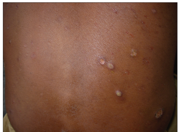
Figure 2: Multiple bullous and erythematous papulonodular lesions over back (Case three)