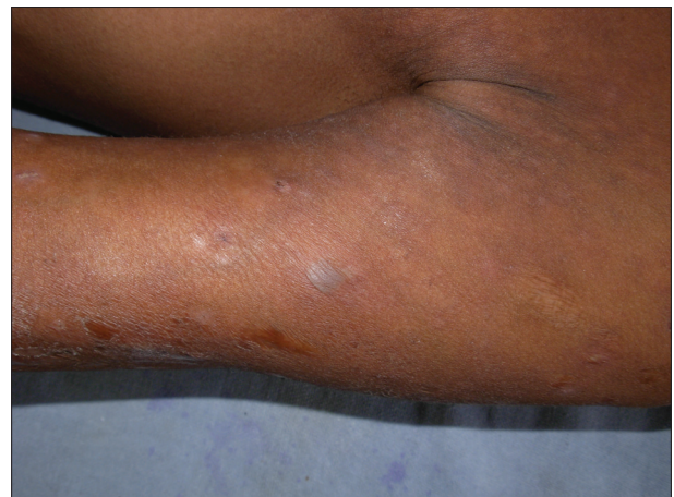
Figure 1: Bullous lesion over left arm (Case one)

On examination, all patients showed hypoaesthetic, hypopigmented plaques ranging in size from 2 × 3 cm to 10 × 8 cm over the extremities and trunk with variable degree of infiltration over face and back. The ulnar, lateral popliteal and posterior tibial nerves were thickened and tender in all patients. All patients