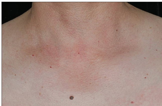
Figure 1a: Erythematous macules and patches symmetrically distributed on anterior neck

The term SDRIFE that is symmetrical drug-related intertriginous and flexural exanthema was first described by Häusermann et al. in 2004, and five diagnostic criteria were proposed: (1) Exposure to a systemically administered