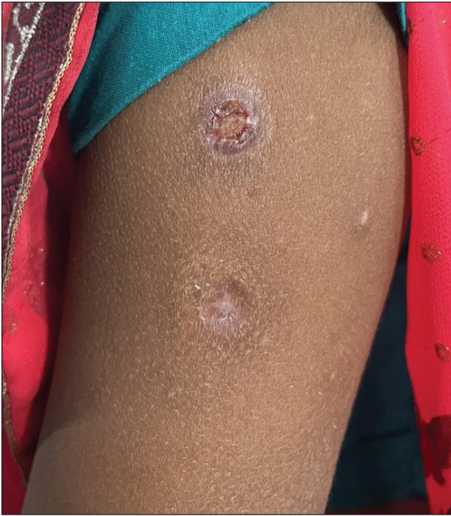
Figure 4: Superficial ulcer with surrounding erythema on left arm – 1 week after administration of MIP vaccine. Old healed scars can also be noted.

of the effective vaccines for the prevention of leprosy that could be used under national programmes, with or without chemoprophylaxis, for contact with leprosy patients and the general population. Evidence of adverse effects was found to be limited.