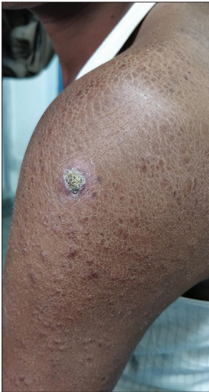
Figure 5a: Patient with granulomatous dermatitis after MIP vaccination showing crusted erythematous nodule at the site of injection surrounded by ichthyosiform changes and multiple reddish-brown papulonodules on the left upper limb.

Combining MIP vaccination as immunotherapy to newly detected cases and as immune prophylaxis to their contacts