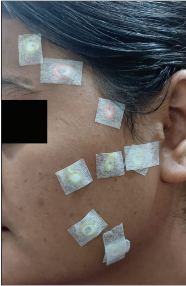
Figure 3: Surgical tape stuck on the skin area to be anaesthetised.

Declaration of patient consent: Authors certify that they have obtained appropriate patient consent.