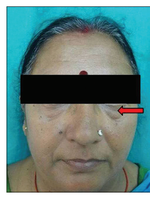
Figure 5: Infraorbital laxity