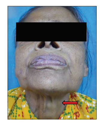
Figure 14: Neck volume at rest

dimensions, both of which can explain the variability of more than 30% of this scale. The first dimension consists of the items forehead lines at rest, upper eyelid laxity, visible bony prominences of upper cheek, fullness of cheeks, nasolabial fold at rest, cheek skin elasticity, lip wrinkles at rest, perioral wrinkles at rest and pigmented spots. The other dimension consists of upper evelid laxity, infraorbital laxity, nasolabial fold at rest, lip wrinkles at rest, descent of corner of the mouth, jaw line at rest and neck volume at rest. It is noteworthy that items from the first dimension mostly result from degeneration of skin and subcutaneous tissue. On the other hand, items from the second dimension result from gravitational effect These were named as wrinkles and sagging, respectively, by Allerhand et al., who found a similar component composition in their facial aging scale.<sup>[23]</sup> Interestingly, we did not find pigmentation to be an important factor, in contrast to the study by Guinot et al. , in which the study population had fair skin.<sup>[25]</sup> Pigmented spots do not appear to be an important determinant of the score, possibly due to darker skin hue of Indians. A similar factorial structure was reported by Bernois et al., where the study population consisted of woman subjects from western India.<sup>[16]</sup> Although wrinkling and sagging