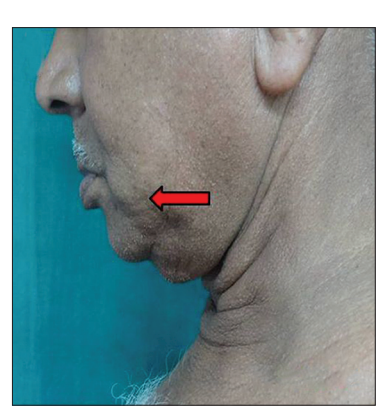
Figure 9: Cheek skin elasticity