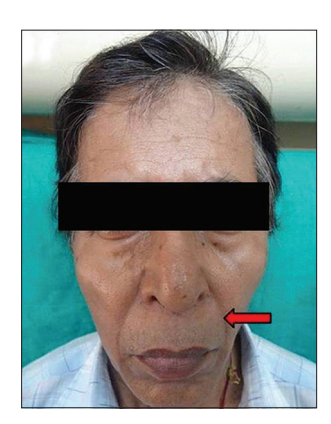
Figure 8: Nasolabial fold