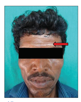
Figure 3: Forehead lines