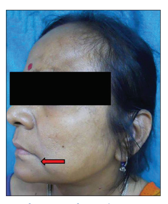
Figure 11: Descent of corner of mouth