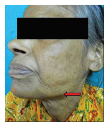
Figure 13: Jawline at rest