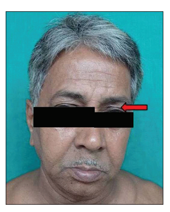
Figure 4: Upper eyelid laxity