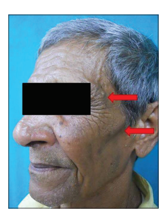
Figure 15: Pigmented spot

area for further research. On literature review, it was found that lip and perioral wrinkles develop due to degenerative changes of skin and orbicularis oris muscle rather than from loss of lip volume. Genetic factors may explain the localized accelerated degeneration in woman subjects.<sup>[24]</sup> Rzany et al. also found a greater propensity towards lip wrinkles among women.<sup>[12]</sup>