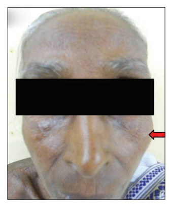
Figure 6: Visible malar prominence