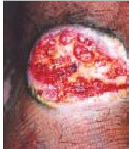
Figure 1: Large ulcer with everted margins and keratotic crusts

We describe a 25-year-old male who presented to one of us (UD) with a non-healing ulcer over the anterior aspect of the left leg just above the ankle of about four to five months duration [Figure 1]. The ulcer was large, 4 cm in diameter and with a raised everted keratotic edge. The ulcer floor was hypertrophic, covered with slough and keratotic crusts; the