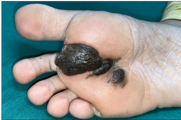
Figure 1a: Three well-defined hyperpigmented plaques on the sole of the right foot.

melanin in the upper dermis and naevus cells interspersed within the dense collagen bundles and extended around the adnexal structures. A diagnosis of cerebriform congenital melanocytic naevus (CMN) was made, which is a rare morphological variant of CMN reported previously on the scalp. The index case is the first report of cerebriform CMN on the sole of the foot.