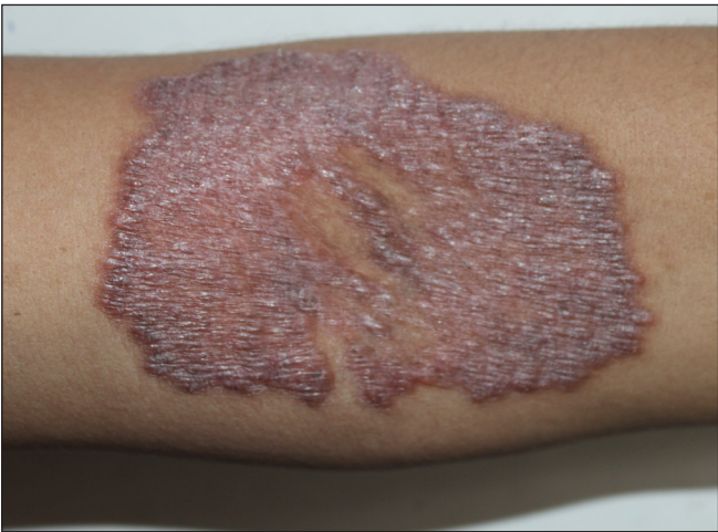
Figure 2: A well-defined erythematous plaque over the forearm in a 26-year-old female.