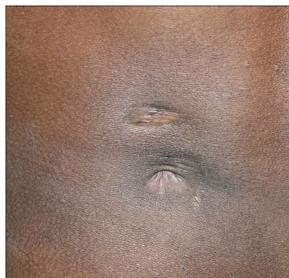
Figure 1b: Post-treatment healed sinus with puckering in the same patient.