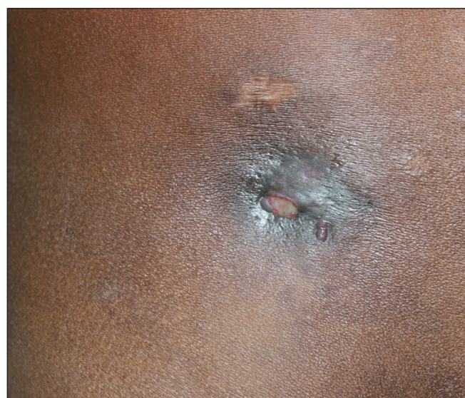
Figure 1a: Draining sinus above the right inguinal region in a 27-year-old male.

A total of seven out of 54 patients with CTB were diagnosed as Drug resistant (DR-TB) in the last 4 years. All the cases were HIV negative. Three patients had lupus vulgaris, two had scrofuloderma, one had tubercular abscess, and one had tubercular chancre [Figures 1–3]. In six patients, resistance to rifampicin was subsequently managed with an Multidrug resistant (MDR)-TB regimen (all oral longer MDR regimen – bedaquiline for six months; levofloxacin, linezolid, clofazimine, cycloserine for 18–20 months). In one patient where isoniazid (INH) mono-resistance was detected, anti-tubercular therapy (ATT) was given as per the standard INH resistance protocol. Response was seen starting at 4 weeks, one patient was lost to follow up and others completed treatment with complete healing. Antitubercular treatment (ATT) was well tolerated, except in one patient where flu-like symptoms were troublesome for the initial 2–3 weeks. No significant lab abnormalities were noted [Table 1].