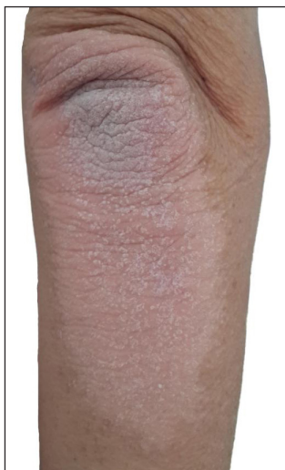
Figure 1: A salmon-coloured erythematous plaque with follicular hyperkeratosis, located on the elbow.

All data of PRP patients from the last 20 years were analyzed. Patients' data were accessed through the hospital's information processing system and evaluated in detail. Age, sex, accompanying diseases, drug usage, clinical features, subtype of PRP, preliminary diagnoses of skin biopsies, a detailed analysis of histopathological findings, and treatment agents were investigated and recorded. The patients <18 years were categorised under the paediatric group, and all the patients were divided into Griffiths' types. 3 The clinical lesions of the participants were described under subheadings, such as erythematous scaly plaques, either limited or widespread, palmoplantar keratoderma, intertriginous involvement, and erythroderma. The patients were divided into two groups having 'definite' or 'probable' diagnoses. Specific clinical findings of the disease included salmon-coloured erythematous scaly plaques, orange-red plaques, erythroderma with islands of spared skin, prominent erythema, follicular hyperkeratosis, and palmoplantar keratoderma [see Figures 1 and 2]. Specific histopathological findings included hyperkeratosis, focal parakeratosis, alternating vertical and horizontal parakeratosis, and orthokeratosis (checkerboard pattern) [see Figure 3]. The patients who were diagnosed