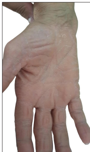
Figure 2: Palmar keratoderma in a patient with PRP.