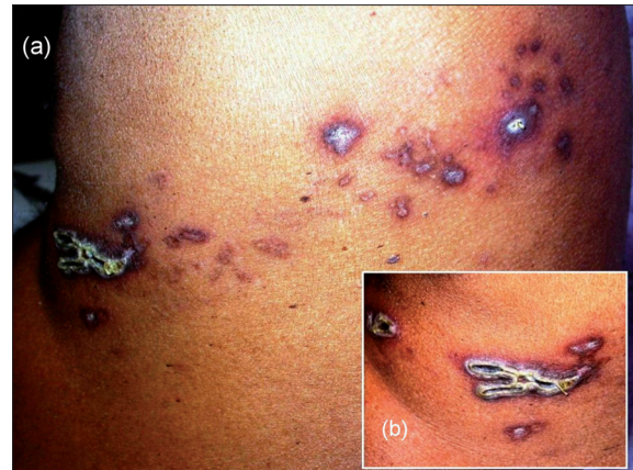
Figure 1: (a) Keratotic and umbilicated skin lesions with a big plaque, at the site of healed herpes zoster on left side of chest. (b) Close-up of the giant, scissor shaped lesion with chamois leather like crust along with scars of herpes zoster

Reactive perforating collagenosis (RPC) manifesting at