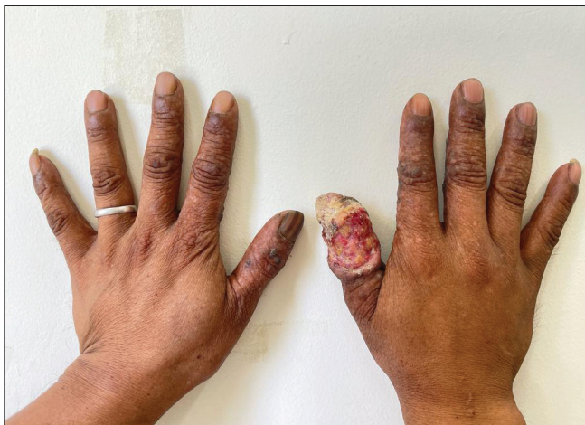
Figure 1: Ulcer involving dorsum of right thumb with indurated rolled out borders.

On examination, there was a single ulcero-proliferative lesion involving his dorsal right thumb extending from the hyponychium until 2 cm distal to the metacarpophalangeal joint. There was onychia and an increased girth of the