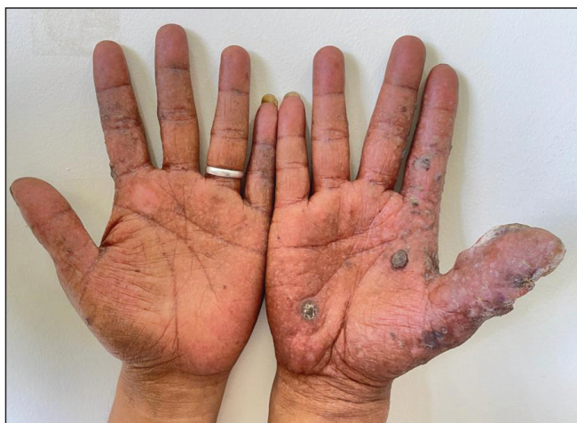
Figure 2: Poikiloderma and hyperkeratotic lesions involving the palms (more on the right hand side).

The patient also immersed his bare right hand into the developer solution frequently for 20 years. The X-ray developer solution contains hydroquinone and its carcinogenic potential is evident through previous reports of SCC on the face following its usage as a bleaching agent. 3 Apart from the present case, there is a single report, describing SCC involving the right thumb in a radiographic technician due to occupational exposure. 4