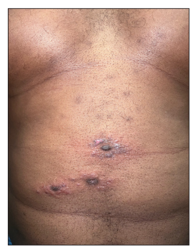
Figure 1: Erythematous to violaceous papules and plaques arranged in a corymbiform configuration on the abdomen.

superficial and deep mixed inflammatory cell infiltrate, and immunohistochemical staining for Treponema pallidum highlighted numerous spirochetes [Figure 2]. A positive syphilis enzyme immunoassay and reactive plasma reagin test, along with this unique bombshell-like configuration were diagnostic of a rare form of secondary syphilis known as corymbiform syphilis.