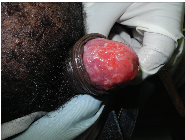
Figure 1a: Genital penile erosions before treatment

Herpes simplex virus infections are exceedingly common and pose a particular problem in immunocompromised patients. They may experience an excessive number and size of lesions in both primary and reactivated herpes simplex virus infections in comparison with immunocompetent patients. As CD4 cell counts drop and immunosuppression worsens, recurrent episodes increase in frequency and severity until there is no period of complete healing between episodes. Nonhealing ulcers of the genital region in immunocompromised patients should elicit a high degree of