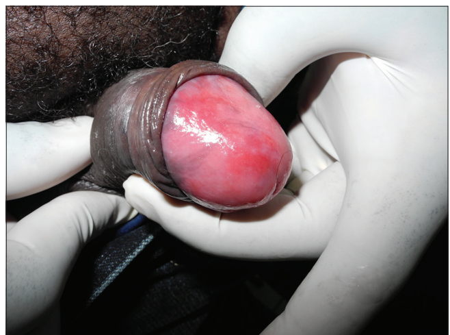
Figure 1b: Clinical result after imiquimod therapy