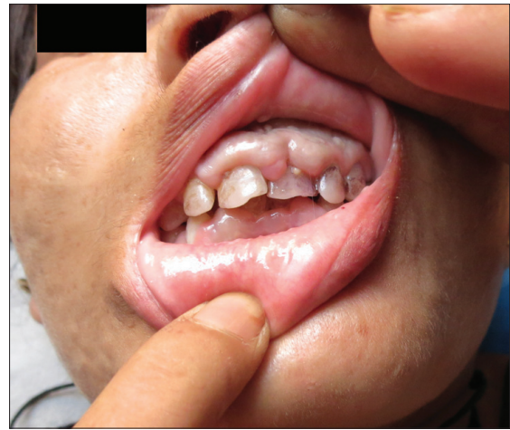
Figure 2: Gingival hypertrophy