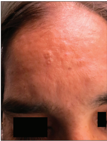
Figure 1: Umbilicated, skin-colored to slightly erythematous, infiltrated papules and plaques