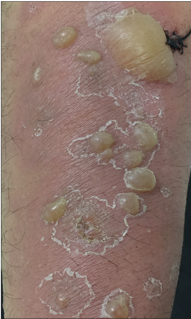
Figure 1d: Multiple tense bullae overlying an erythematous, coalescent, scaly plaque present on ventral aspect of right forearm, displaying a gradient in which bullae adjacent to the biopsy site (showing suture) are the largest

disorders. Further documentation and characterization of such cases are needed to unfold the underlying pathogenesis to help in treatment planning and search for newer therapeutic agents.