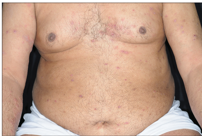
Figure 1a: Multiple erythematous and excoriated papules and nodules on chest, abdomen, and upper limbs resembling prurigo

A 61-year-old male presented to us with multiple red pruritic papules and nodules on chest, back, and lower limbs [Figure 1a] for the last 2 years. He started developing annular plaques with erythematous, indurated coalescing margins along with central clearing and mild scaling, on trunk and limbs [Figure 1b] since last 2 months. Few targetoid lesions were also noted on the ankles [Figure 1c]. No history of drug intake (other than antihistamines) or associated systemic illness was elicited. A punch biopsy was performed from a representative lesion on right forearm with differential diagnosis of urticarial vasculitis, erythema multiforme, urticarial BP, and sarcoidosis. Interestingly, the patient returned after 48 hours, with multiple new blisters confined to the right forearm, around the biopsy site [Figure 1d]. The bullae were tense, filled with serous fluid and variably sized. Remarkably, the bullae adjacent to the biopsy site were the largest. An additional biopsy (perilesional) was performed for direct immunofluorescence (DIF). Histopathology revealed mild acanthosis, subtle spongiosis, eosinophilic exocytosis and an upper dermal eosinophilic infiltrate distributed along the basal layer and forming an occasional microabscess in dermal papilla [Figure 2a], suggestive of urticarial stage