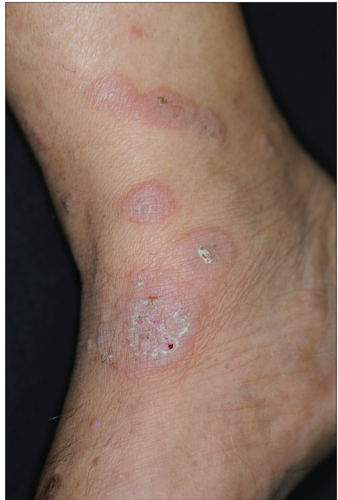
Figure 1c: Few targetoid lesions noted on the ankle

Another hypothesis emphasizes the role of physical irradiation in altering the basement membrane and exposing the modified antigens, resulting in stimulation of autoantibodies and formation of antigen–antibody complexes, complement activation resulting in blister formation. 5 Literature supports a further hypothesis for radiation-induced BP that irradiation causes impaired immune reactivity of T-helper cells and T-suppressor cells, resulting in the development of antibodies targeted against the self-antigens. 9 Both these hypotheses are relevant for cases occurring around the sites of trauma like burns and irradiation, with induction of BP-specific