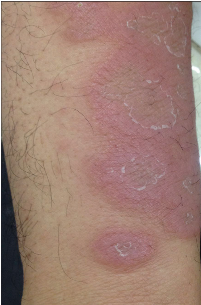
Figure 1b: Right wrist area showing well-circumscribed coalescing erythematous, annular plaques with central clearing and mild scaling

and cytokines resulting in a cleft at the DEJ. 8 Trauma results in tissue destruction, triggering a cascade of proinflammatory stimuli and recruitment of inflammatory cells, particularly granulocytes. The autoantibodies binding to granulocytes further activate the complement and initiate the proteolytic enzymes to directly interfere with adhesion function of the autoantigens. 5,8 Our case supports this hypothesis, as the patient presented with the urticarial stage of BP for 2 years, before trauma triggered the probable low titres of autoantibodies to precipitate the bullous stage of the disease.