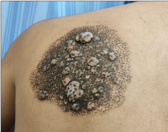
Figure 1: A well-circumscribed lesion on the back consisting of multiple brownish-black to bluish hyperpigmented macules and multiple soft well-circumscribed papules and nodules.

Dermoscopy revealed follicle-centred brownish-black to bluish pigmentation in a reticulo-globular pattern, with intervening normal skin [Figure 2]. On histopathology, the dermis showed aggregates of uniform naevus cells surrounding the hair follicles along with abundant melanophages. Based on clinical features, dermoscopy, and histopathology, we diagnosed it as congenital follicular melanocytic naevus, also called spotted grouped pigmented naevus.