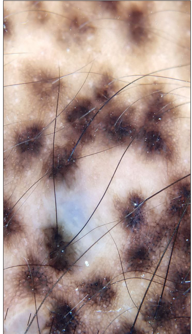
Figure 2: Dermoscopy showing follicle-centred brownish-black to bluish pigmentation with a reticulo-globular pattern and intervening normal skin (DermLite DL3N; contact, polarised, 10x).

How to cite this article: Singh V, Srivastava P, Sharma S, Khunger N. A rare case of spotted grouped pigmented naevus: Congenital follicular melanocytic naevus. Indian J Dermatol Venereol Leprol. 2025;91:128-9. doi: 10.25259/IJDVL_1110_2023