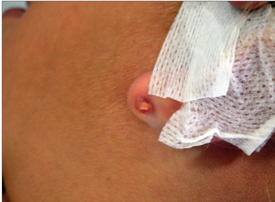
Figure 1: Clinical view of the nodule of left ear lobe

A six-year-old girl presented with a 10 months' history of a nodule on the left ear lobe. Examination revealed that there was a single very firm nodule of about 0.5 cm diameter behind the ear lobe. It was characterized by peripheral erythema and arborizing telangiectatic vessels [Figure 1]. Dermatoscopic evaluation revealed the presence of arborizing, branching and non-branching vessels radiating toward the center of a gold shiny background area; the vessels did not cross the center of the nodule [Figure 2]. The lesion was asymptomatic. The mother reported a previous occurrence of what seemed to be an infection following ear piercing with the spring-loaded gun technique. She also reported never having found the back of the earring again. After administration of a local anesthetic, the nodule was opened surgically. The back of a gold butterfly earring, completely embedded in the left ear lobe, was removed [Figure 3].