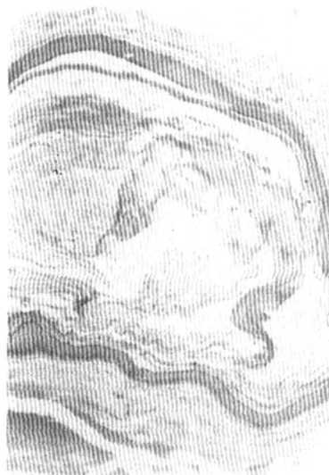
Fig. 2. Histopathology from one of the intact swellings showing epidermoid cyst.

From the Department of Dermatology, SMS Medical College, Jaipur, India.