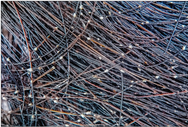
Figure 1a: Trichoscopy showing intermittent nodes along hair shaft (Mode – non polarised hand held, magnification – 10x, make – Heine Delta 20)