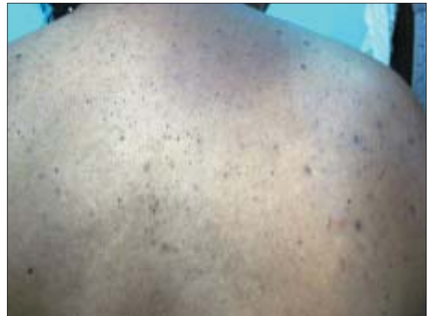
Figure 2: Black comedones and pits over the back in case 1