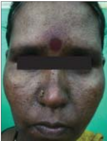
Figure 1: Reticulate pigmentation and pits in case 1

material forms in the pits over a period of three to four months and then falls on its own to again form fresh black material. There was no history of erythema of the face. There was no significant past medical or surgical history. Patient’s grandfather, mother, aunt and two brothers were affected with the same disease. Her general physical examination and systemic examinations were within normal limits. Cutaneous examination revealed diffuse, black, comedone-like lesions distributed over the forehead, cheeks and neck with multiple pits over the upper chest and back. Trunk was more severely affected when compared to the face and neck [Figure 4]. There was reticulate pigmentation over the flexures. Few nodular cysts were also noted over the back. Rest of the cutaneous examination was normal. All relevant investigations were within normal limits. Biopsy was done from the representative skin lesion over the back which revealed elongated rete ridges with increased melanin pigment in the lower part of the rete ridges and plugging of pilosebaceous orifice with keratin.