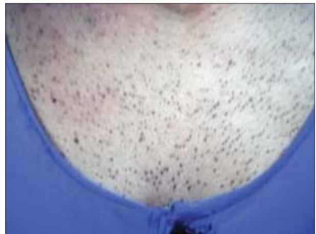
Figure 4: Follicular pits over the chest in case 2