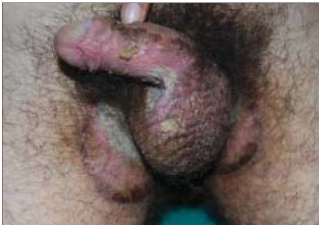
Figure 2: Groin, ventral surface of the penile shaft and scrotum showing similar lesions