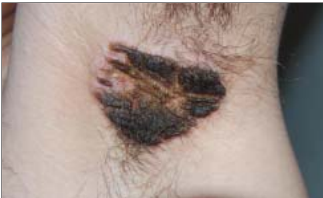
Figure 1: Well circumscribed, hyperpigmented, verrucous plaques in the vault of left axilla

In 1991, Northcutt, Nelson, and Tschen described a clinicopathological entity from a series of biopsy specimens of axillary lesions that showed an unusual and unique form