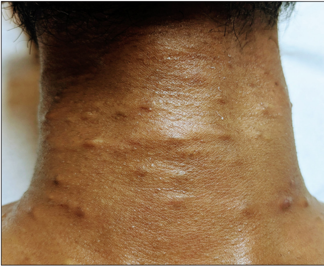
Figure 3: Post-treatment outcome following two sessions of intralesional polidocanol injection demonstrating a reduction in the size and resolution of some cysts with post-procedure hyperpigmentation.

session of polidocanol sclerotherapy was conducted for persistent cysts.