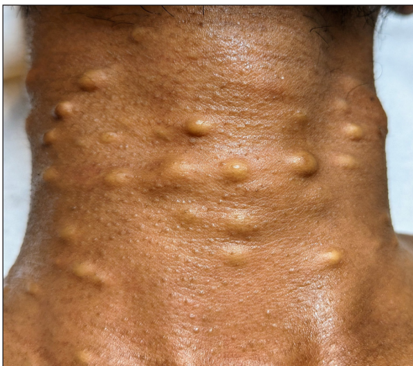
Figure 1: Steatocystoma multiplex on the anterior neck at baseline.

The area was anaesthetised with topical EMLA (eutectic mixture of local anaesthetics) application for 1 hour. Cyst contents were aspirated, and a gentle refilling of each cyst was performed to inject approximately 0.1 mL of 3% polidocanol solution (1:1 with saline) per cyst. Following sclerotherapy, the patient reported minimal local pain which resolved without the need for analgesics. At 4-week follow-up, there was a notable reduction of cyst size and complete resolution of a few of the cysts. However, slight hyperpigmentation was seen on the skin overlying the cysts. Another subsequent