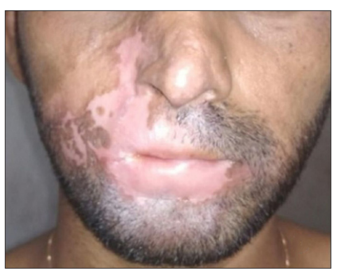
Figure 6: The plaque on the nose, nasolabial area, lips, and necrotic ulcers over the right angle of the mouth healed with depigmentation and scarring.

fungal culture, and molecular methods. Giant cells showing pigmented structures known as sclerotic or Medlar bodies are pathognomonic for the infection.<sup>3</sup> Colonies on culture are classically slow-growing, dark, and velvety with a black obverse, which after 2 weeks of incubation at 25°C, show suede-like aerial mycelium. Under the microscope, septate, branched, pale brown hyphae with several lateral and erect spine-like conidiophores typical of E. spinifera are observed.