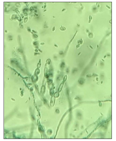
Figure 5: Lactophenol cotton blue mount showing erect, multiseptate, cylindrical, spine-like conidiophores (1000x).

Lactophenol cotton blue mount showed dark coloured, erect, multiseptate, cylindrical, spine-like conidiophores. Conidia were seen to arise apically as well as laterally at acute angles [Figure 5]. Based on the above morphological features, the isolate grown in culture was identified as E. spinifera. The patient was initiated on posaconazole 600 mg/d for 1 week followed by 300 mg/d. After 6 months, there was significant improvement. The hyperpigmented plaque on the nose and right nasolabial area healed with post-inflammatory depigmentation. The haemorrhagic and necrotic erosion over the right angle of the mouth resolved with scar formation [Figure 6]. The patient continues to take posaconazole in a 300 mg daily dose and at the end of 1 year is free of itching with complete resolution of skin lesions. The plan is to continue the same treatment for a further period of 6 months. We describe a rare case of recalcitrant chromoblastomycosis caused by Exophiala spinifera of which there are only a few case reports in the literature.2 Important diagnostic investigations essential to establish a diagnosis include KOH preparation of the skin scrapings, histopathology,