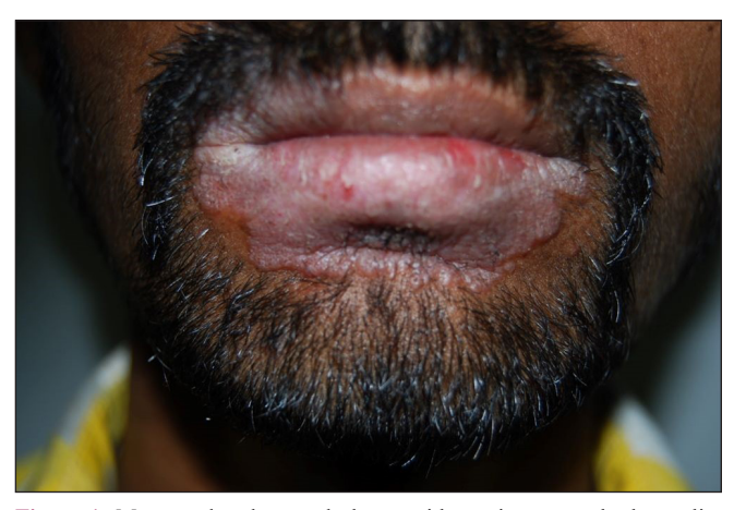
Figure 1: Macerated and crusted plaque with erosions over the lower lip, angles of the mouth, and chin.

showed granulomatous inflammation with lymphocytes, few aggregates of neutrophils, and giant cells exhibiting brownish-pigmented sclerotic bodies which confirmed the diagnosis of chromoblastomycosis. A touch preparation of the skin biopsy specimen in KOH showed sclerotic bodies. The patient had already received itraconazole 200 mg/d for 2 years with no response. Hence, he was shifted to a combination of voriconazole 200 mg/d and terbinafine 500 mg/d for a period of 6 months. Despite the second-line treatment, skin lesions progressed to involve both lips and the right nasolabial area with the development of indurated, hyperpigmented, and mamillated plaques on the nose and haemorrhagic, necrotic, and crusted plaque over the right angle of the mouth with intractable itching [Figure 2]. A second biopsy done also showed a granulomatous reaction with giant cells containing thick-walled golden-brown sclerotic bodies consistent with chromoblastomycosis [Figure 3]. Fungal culture of the biopsy specimen, on Sabouraud's dextrose agar grew moist, yeast-like mucoid colonies with black reverse [Figure 4].