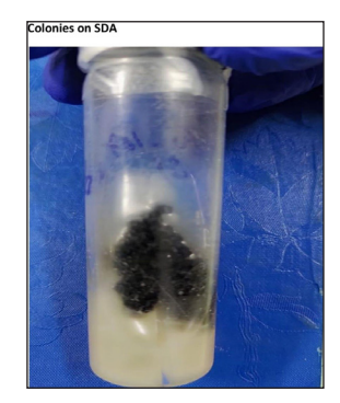
Figure 4: Sabouraud's dextrose agar, showing yeast-like mucoid colonies with black reverse.

Lactophenol cotton blue mount showed dark coloured, erect, multiseptate, cylindrical, spine-like conidiophores. Conidia were seen to arise apically as well as laterally at acute angles [Figure 5]. Based on the above morphological features, the isolate grown in culture was identified as E. spinifera. The patient was initiated on posaconazole 600 mg/d for 1 week followed by 300 mg/d. After 6 months, there was significant improvement. The hyperpigmented plaque on the nose and right nasolabial area healed with post-inflammatory depigmentation. The haemorrhagic and necrotic erosion over the right angle of the mouth resolved with scar formation [Figure 6]. The patient continues to take posaconazole in a 300 mg daily dose and at the end of 1 year is free of itching with complete resolution of skin lesions. The plan is to continue the same treatment for a further period of 6 months. We describe a rare case of recalcitrant chromoblastomycosis caused by Exophiala spinifera of which there are only a few case reports in the literature.2 Important diagnostic investigations essential to establish a diagnosis include KOH preparation of the skin scrapings, histopathology,