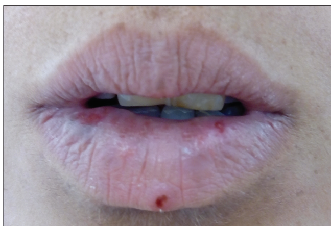
Figure 1: Diffuse erythema, desquamation, fissures and white/pink areas on the lower lip which appeared swollen and rough

A 25-year-old woman with no medical records presented to the Dermatology department with recurrent painful lesions in the lower lip, worsened by sun exposure, of 3-years' duration. There was history of partial improvement in the cooler months of the year. Physical examination revealed diffuse erythema, desquamation, fissures and white/pink areas on the lower lip which appeared swollen and rough [Figure 1]. The patient lived in the countryside, where she had worked for the last 5 years with significant sun exposure, without appropriate photoprotection.