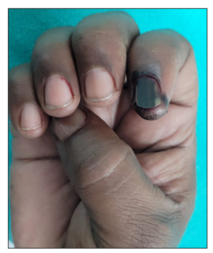
Figure 1: Hyperpigmented, dystrophic and friable nail plate with hyperpigmentation of proximal nail fold, hyponychium and periungual areas.