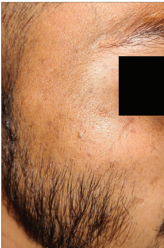
Figure 4: Complete clearance on right side of face after 5 applications of topical measles, mumps and rubella vaccine

recurrence or side-effects, our observations are meant merely for generating a hypothesis about its mechanism of action and further controlled studies are needed to reproduce these results.