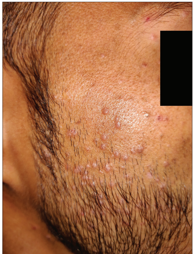
Figure 3: Multiple verruca plana on right side of face before treatment