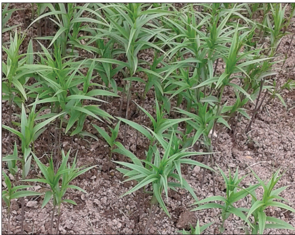
Figure 5: Gloriosa superba