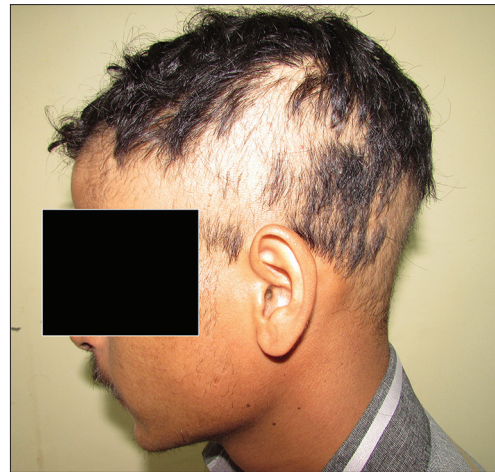
Figure 1: Anagen effluvium involving the scalp and beard in case 1

Following ingestion of the root, hair loss started abruptly after 15 days in one case and after 6 days in the other. Hairs were shed painlessly in tufts while combing or with even a gentle pull. Hair was thin, short and unruly. There was no evidence of inflammation or scarring and there were no exclamation-mark hairs. In addition to the scalp, the beard region was involved in the man while his aunt had axillary and pubic hair loss as well [Figures 1 and 2]. Potassium hydroxide mounts of scalp and hair revealed no fungal elements. Hair microscopy revealed anagen hair [Figure 3]. Histopathology in both patients showed most of the hair follicles to be in anagen phase without any evidence of inflammation [Figure 4]. Meanwhile, the tuber which had been consumed was identified as G.superba [Figure 5]. A diagnosis of anagen effluvium due to the intake of G. superba was made and both patients were counseled regarding the reversible nature of the hair loss. Family members were sensitized to create awareness in their region regarding the toxicity of this plant. Follow-up at 3 months showed regrowth of hair in both the cases [Figure 6].