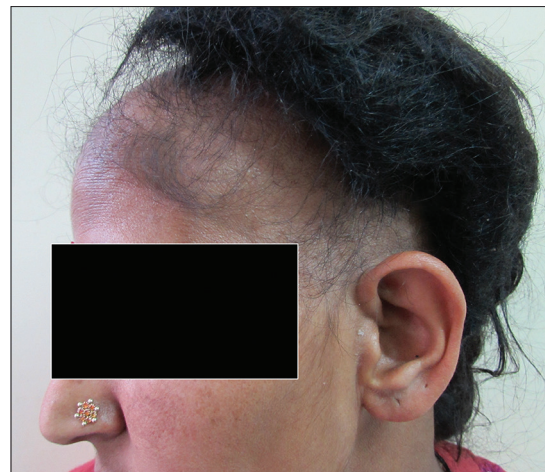
Figure 2: Anagen effluvium involving the scalp in case 2