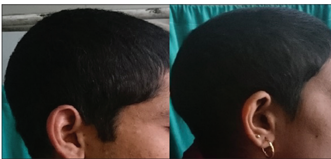
Figure 6: Regrowth of hair at 3 months' follow-up

worms and wounds. [3] In Sanskrit, the plant is known as “garbhapatini” which causes abortion. [4] It has also been used to commit murder and suicide. [3] The plant which grows in tropical India, including the mid-hill zone of Himachal Pradesh, [10] contains many alkaloids such as colchicine, gloriosine, superbrine, chelidonic acid and salicylic acid, colchicine being