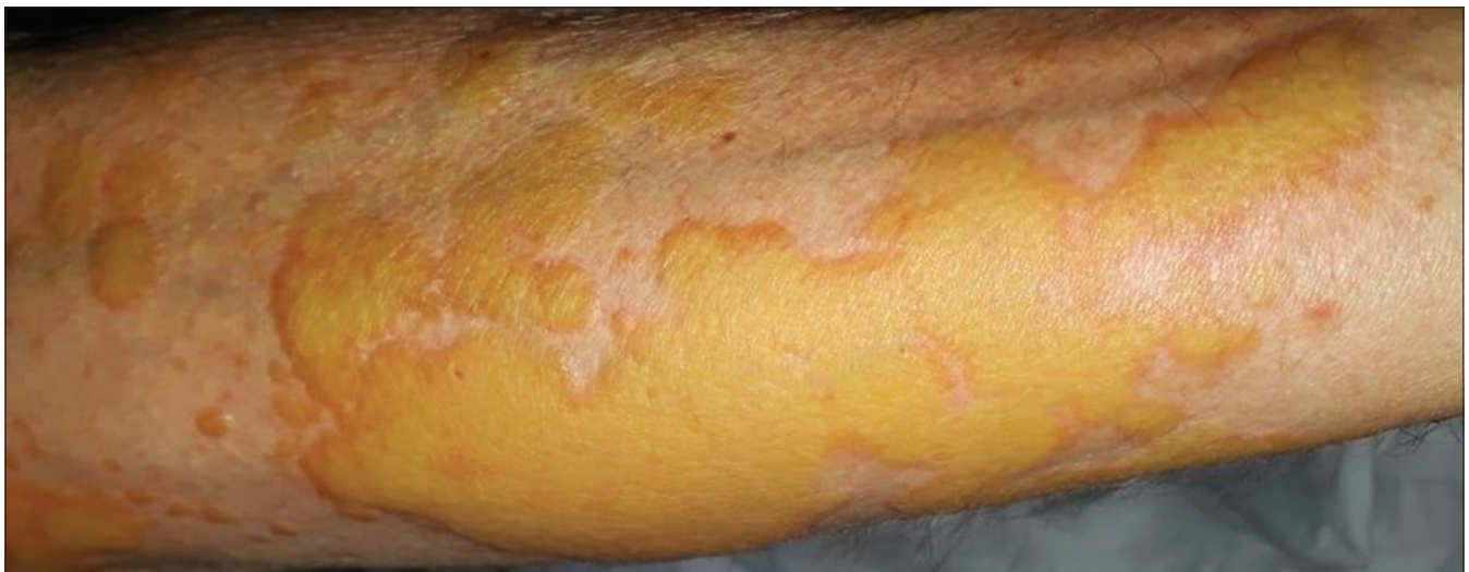
Figure 2: Multiple yellowish raised hives on the right arm

How to cite this article: Koumaki D, Demetriou G, Krasagakis K. Yellow urticaria in a patient with alcohol-related liver cirrhosis and jaundice. Indian J Dermatol Venereol Leprol 2021;87:676-7.