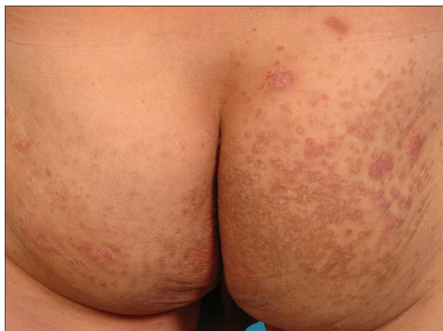
Figure 1: Multiple annular scaly papulosquamous plaques and hyperpigmented macules (buttocks)

The histology report was consistent with porokeratosis. Together with the clinical picture of a chronic persistent rash marked by recurrent acute pruritic exacerbations, the diagnosis of eruptive pruritic papular porokeratosis (EPPP) was made.