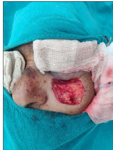
Figure 1b: Full-thickness defect after tumour excision plus 1–2 mm margin of surrounding clinically normal tissue.

How to cite this article: Singh S Hegde N. Marginal micrographic surgery without tumour-frozen sections: A quicker margin control surgery for pigmented basal cell carcinomas. Indian J Dermatol Venereol Leprol . doi: 10.25259/IJDVL_92_2024