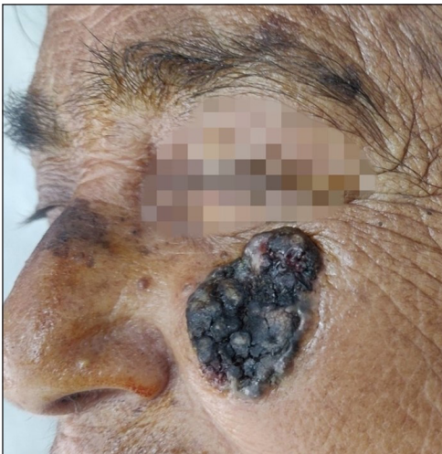
Figure 1a: The nodular pigmented basal cell carcinoma on the left cheek.

A pre-operative dermoscopy is performed to mark the boundary of the healthy skin around the pigmented BCCs. The excision is done using an incision line abutting the tumour ensuring complete excision on the surface and the specimen is sent for routine paraffin sectioning. The deeper and side margins of the tumour are removed until the end of the pigmented area, superficial fat lobules or altered consistency, whichever is the deepest. The defect's edge is then divided into clock-face-like four quadrants, labelled I (12 to 3 o'clock), II (3 to 6 o'clock), III (6 to 9 o'clock), and IV (9 to 12 o'clock). Next, a strip of tissue with 1–2 mm skin width is excised from the edge and a 1–2 mm disc from the floor of the wound is similarly excised and both are divided as above [Figures 1a–c]. The inner edges are inked using a