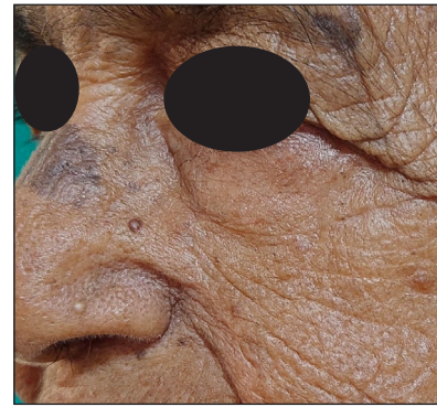
Figure 2: Follow up at 9 months following closure using cheek advancement flap by a modification of the Mustarde flap.

Conflicts of interest: There are no conflicts of interest.